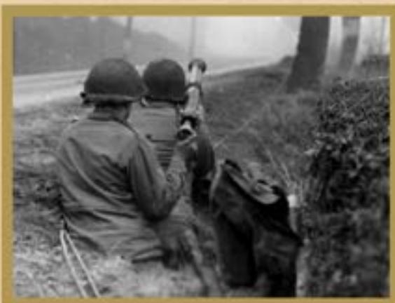
An 82nd anti-armor bazooka team covers a road near Cheneux December 20, 1944.