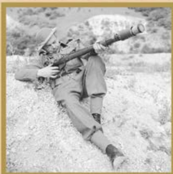
Grenade, Rifle No. 68 /AT

If a Character is armed with a rifle fitted with a grenade launcher he can always fire it in the game (as it happens to one armed with hand grenades). However all types of rifle grenades are always available to him, they do not require to be bought separately and can not be transferred.