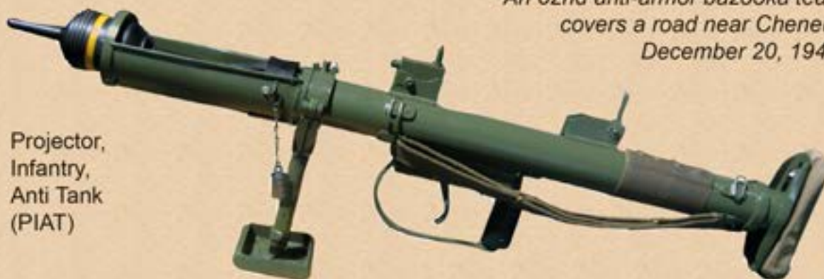
Projector, Infantry, Anti Tank (PIAT)

The British PIAT, despite not being a recoilless rocket weapon (technically it was a man-portable mortar), was functionally very similar and it is treated as such in these rules.